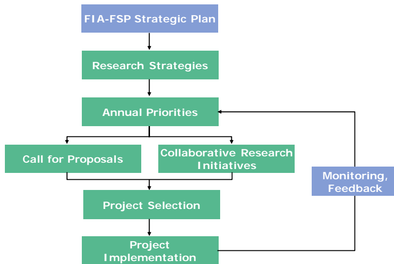
Figure 1 Strategic Framework for FIA-FSP research.